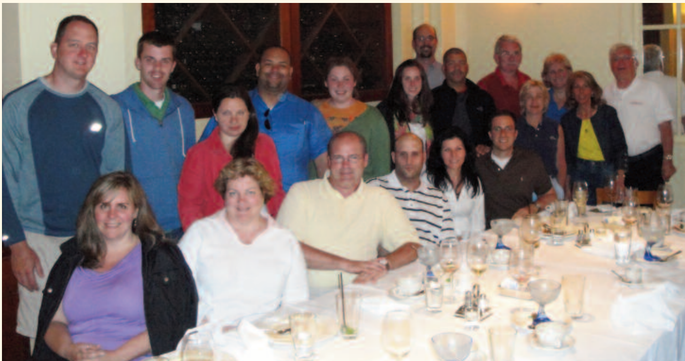
The Prep contingent at the Colloquium